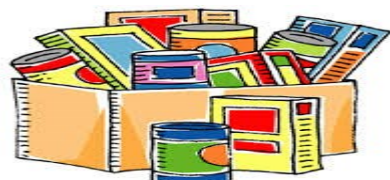
Feeding the Community

Safe Arrival ATTENDANCE Line: 905-417-9227 & follow the prompts or Login to: yrdsb.edsby.com